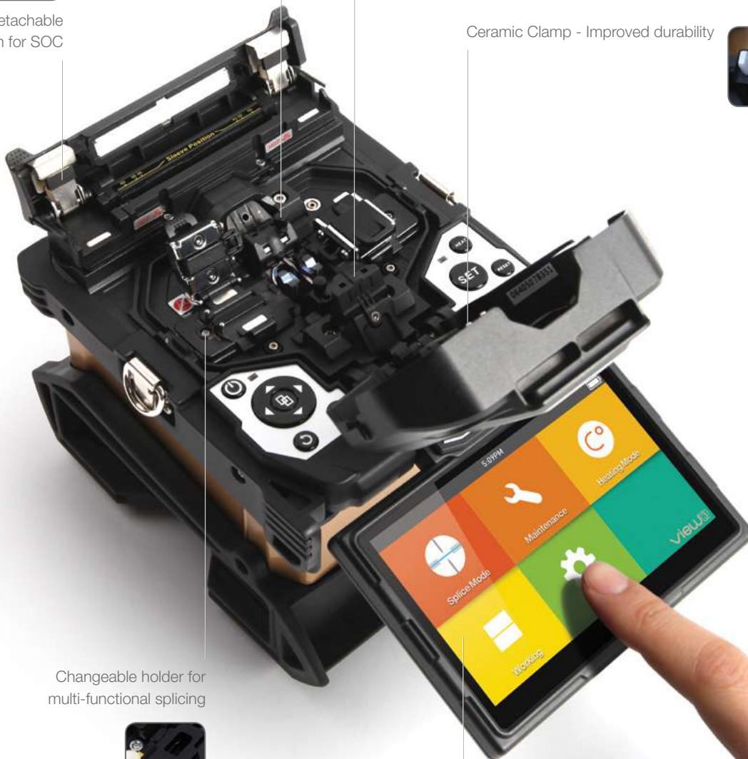
Changeable holder for multi-functional splicing