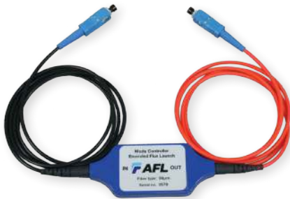
Encircled Flux (EF) Mode Controller

EF Compliant solutions available, see pages 3 - 4 for details